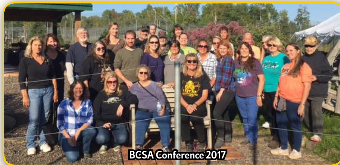
BCSA Conference 2017

Tigers@TarpentineCreek.org 479-253-5841 TarpentineCreek.org