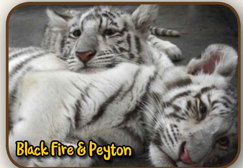
Black Fire & Peyton