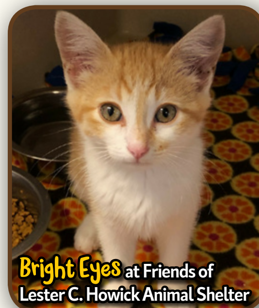
Bright Eyes at Friends of Lester C. Howick Animal Shelter

Take time to meet a domesticated shelter cat. Visit your local shelter or follow us on Facebook, where we offer an album full of adoptable cats, with a new one featured weekly.