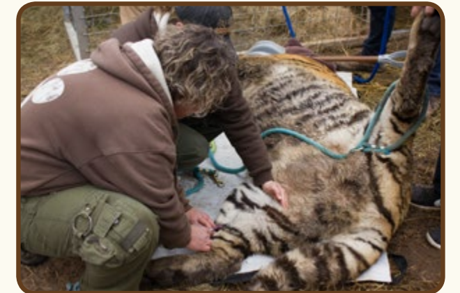
Blood drawn in Oklahoma was tested immediately after arrival at TCWR. Results showed that Diesel had an elevated white blood count, his red blood count was extremely low at 10%, and he had clear signs of a blood pathogen causing his illness.