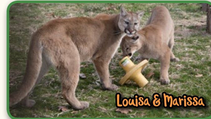
Louisa & Marissa

You can champion their lifestyle by making a donation on our website or paying a visit to the Refuge! Our summer hours - 9 AM - 6 PM - start March 10!