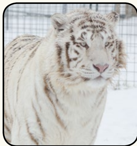
Tommie 3 years