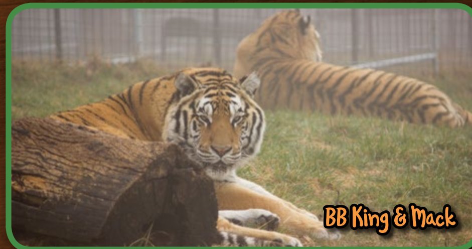
BB King & Mack

The passing of winter and its frigid conditions brings forth the temperate days of spring, luring us outside on dry days to plant gardens and do yard work before the heat of summer sets in. Meanwhile, the tigers at TCWR delight in the cool spring weather that is typically accompanied by showers – in fact, they are more visible and active when it is raining!