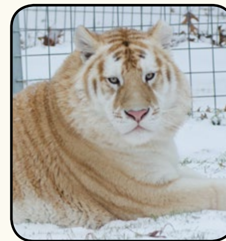
Tigger 18 months