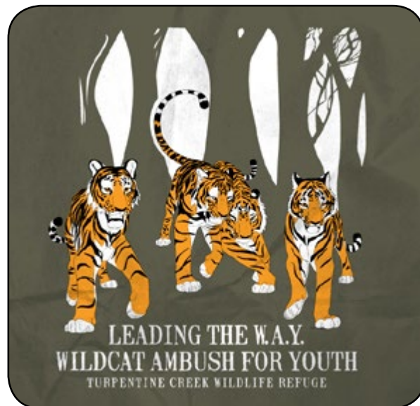
W.A.Y. T-shirt Graphic