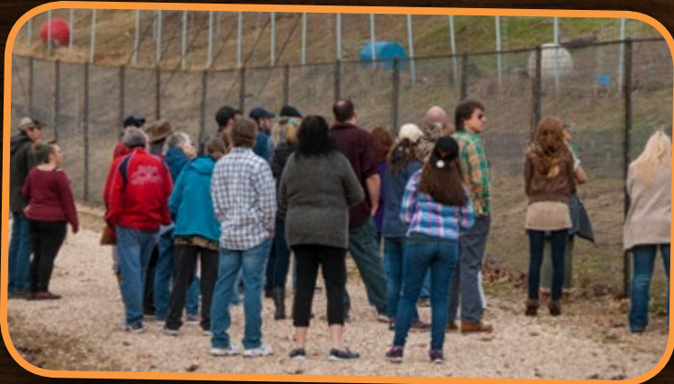
Take An Educational Guided Tour