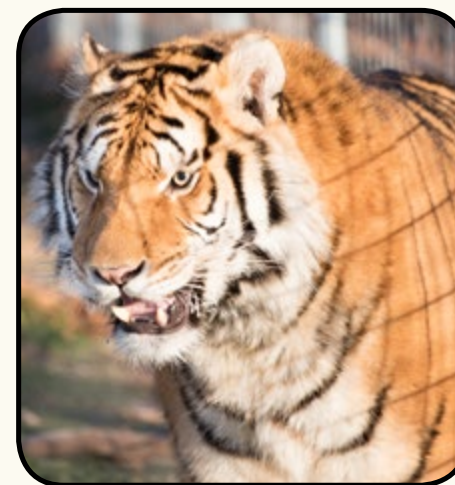
Floyd 21 months