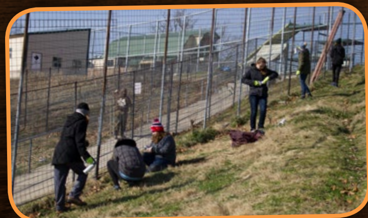
Make The Most Of Your Visit - Volunteer

Viewing exotic wildlife in their natural habitat is an animal lover's dream, but one that's not feasible for many of us. There's an entire industry in the U.S. that benefits from this dream by giving people the opportunity to see these animals without leaving the country. Lucky for animal lovers, right? Not necessarily.