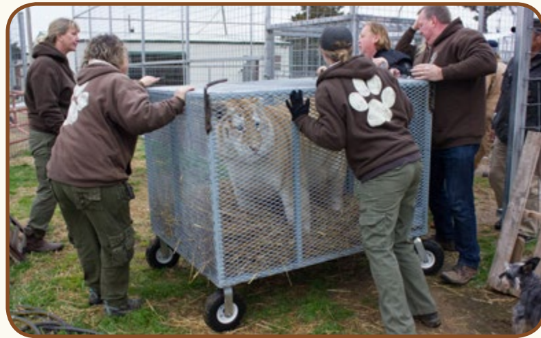
Although only 16-months-old, Tigger is a larger tiger and it took a little extra effort to move him. All the cats rescued from Oklahoma are overweight, which added to the challenge of the rescue.