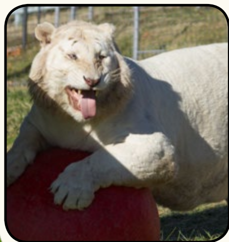
Robbie 4 years