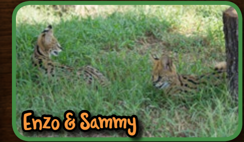
Enzo & Sammy

Construction materials have risen in cost over 25% this year, and your donations are needed more than ever to make sure every animal at TCWR receives the best living conditions possible in captivity!