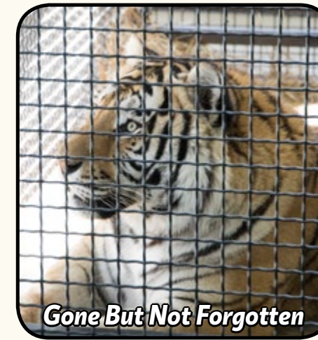
Gone But Not Forgotten