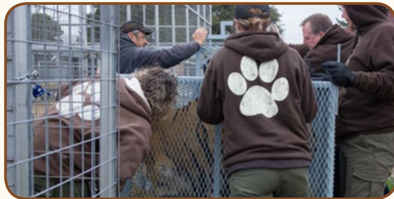
Floyd, one of six tigers from Oklahoma, was the first to load during the rescue.