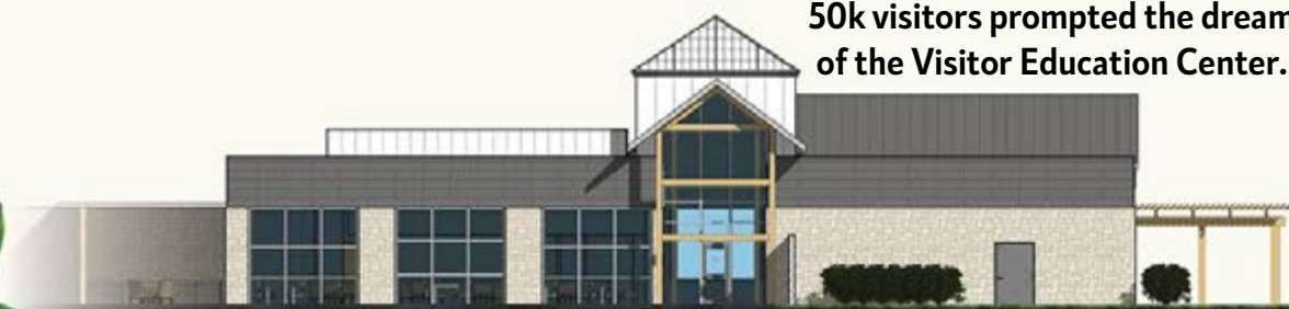
50k visitors prompted the dream of the Visitor Education Center.

You were there in the beginning... we need you here today.