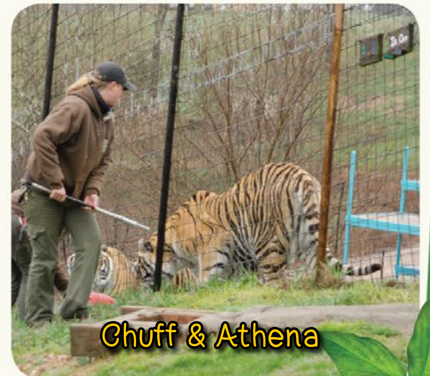
Chuff & Athena

The health and safety of our animal residents is a top priority for the TCWR team. We hope through preventative vaccinations we can make sure that our animal residents can live long and happy lives here at the Refuge. Through your donations and support, we can continue to rescue big cats in need and provide the best possible care.