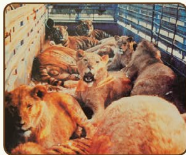
42 big cats in three cattle trailers prompted the founding of TCWR.

You were there in the beginning... we need you here today.