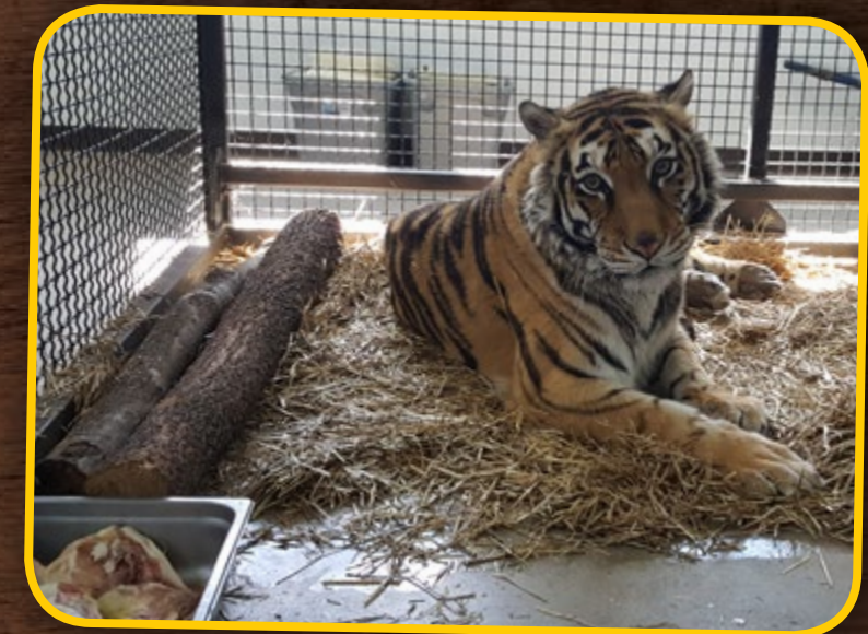
Izzy recovers nicely in our vet hospital.