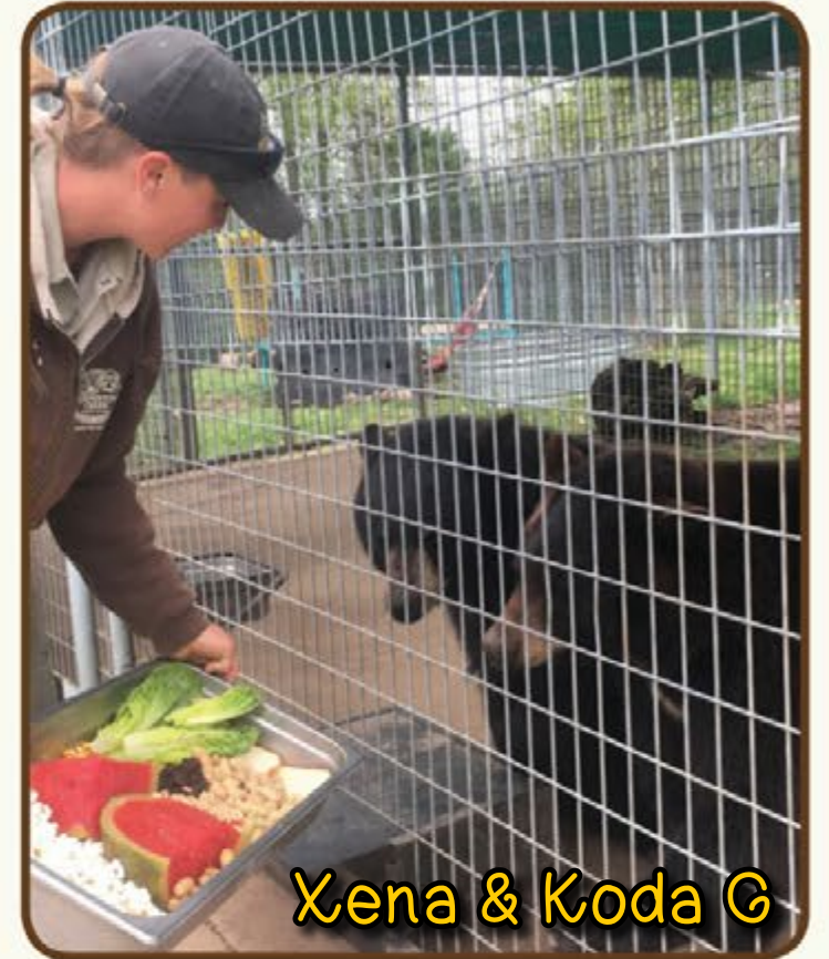
Xena & Koda G

Our team is committed to enhancing the lives of our animals along with the experience of the guests. We are continually finding ways to expand our green initiative program to make your donations go farther. Through this program, your donations will last a lifetime and not only help the animals that call the Refuge home today but also animals that we rescue in the future. Donate today to help us, help them.