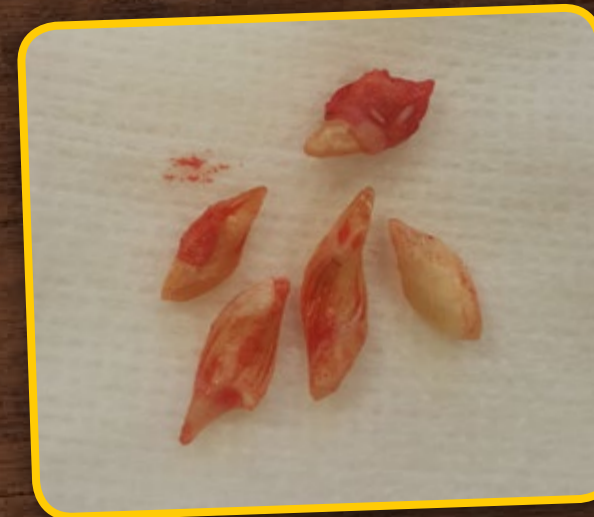
Claw pieces that were growing under the skin.