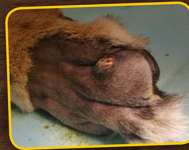
Izzy's paw prepped and ready for surgery.

Species: Tiger ( Panthera tigris ) Sex: Female DOB: December 10, 2002 Arrival Date: September 14, 2012