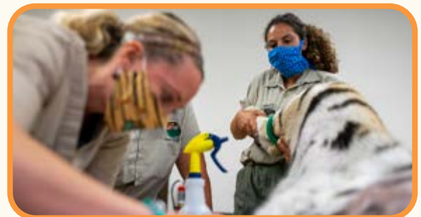
Now that we are out of quarantine, we have resumed on site treatment for animals, while still taking extra precautions to protect them from COVID exposure. Your donations allow us to provide quality veterinary care for all the animals who call the Refuge home.