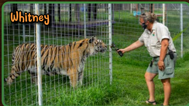
Some of our animals can only be seen during private tours, with a virtual tour you can see the animals at Rescue Ridge!

Adults and children will be equally delighted and entertained by these live tours we are currently offering. If you have a favorite resident, we can even try to feature that animal in your tour. We ask for at least three (3) days to set up your event, and please remember our team is only available from 9 am to 5 pm daily. You can get more information and locate the form to sign up at our website at TCWR.org/virtual-private-tours . Book your virtual tour today!