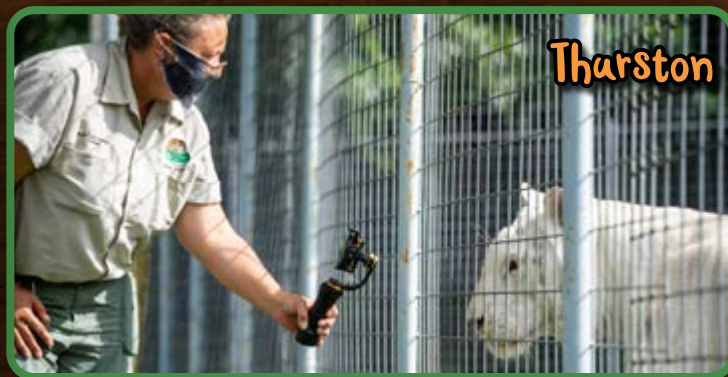
Taking a virtual tour allows you to see your favorite animal at the Refuge! Take a one on one tour with an animal care team member!