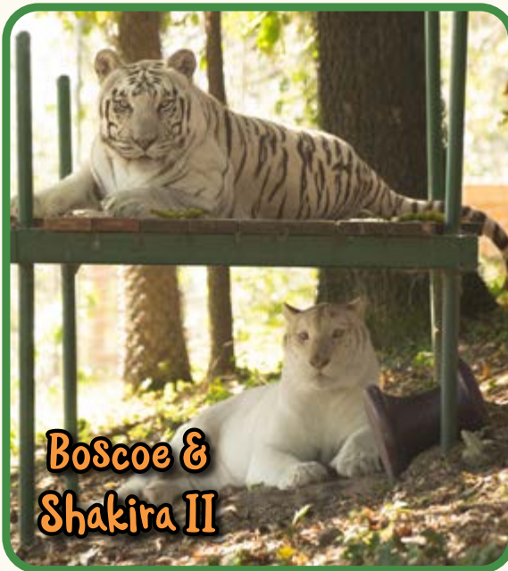
Boscoe & Shakira II

Joey, Aurora, and their habitat mates are survivors of the cub petting industry. The Big Cat Public Safety Act prevents hands-on interaction with big cats of any age. Contact your congressman today at tcwr.org/advocacy to support the BCPSA.