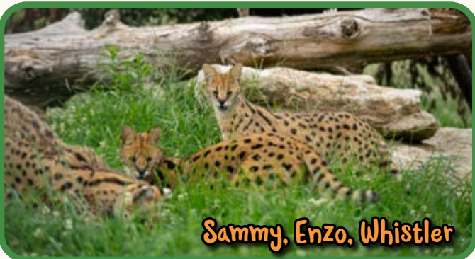
Sammy, Enzo, Whistler

Servals are some of the best hunters with a 50% success rate!