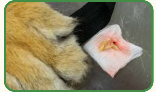
Claw shards removed from Izzy's paws due to an improper declaw performed by her previous owner.

Over the years, we have encountered so many veterinary issues with the animals we rescue. We can never actually compute what the cost will be to care for each one we save. Cats like Izzy can require multiple surgeries, some get special diets, others need multiple medications, and now B.B. King needs chemotherapy. Your monthly donation helps us plan for every day expenses and allows us to be prepared for surprises, like Izzy's surgeries or B.B. King's chemo, that can occur. Your monthly contributions are vital to our mission. Thank you as always for your support in caring for and giving these animals the best life possible.