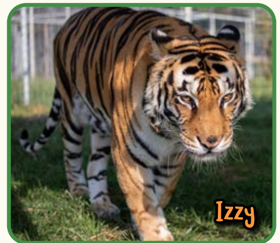
RIP Izzy, 2002 - 2020.

Share your love of TCWR, tell a friend about our mission, share our social media.