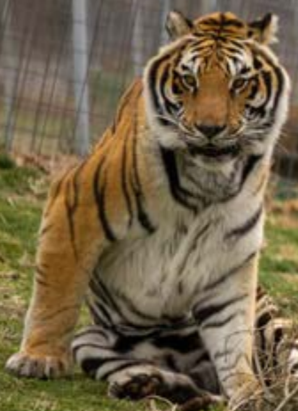
Chuff & Athena

Willy, like most big cats, tends to be more active at night. During the hottest parts of the day he sleeps, but you can catch him playing with his toys when it is cooler.