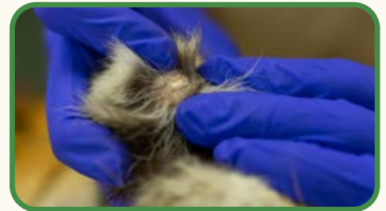
When claws are removed they can regrow under the skin if they are not fully removed. This causes life long pain for the animals.